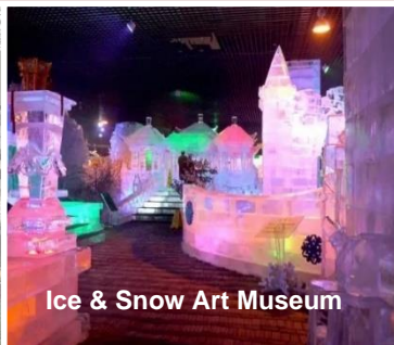
Ice & Snow Art Museum