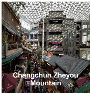
Changchun Zheyou Mountain