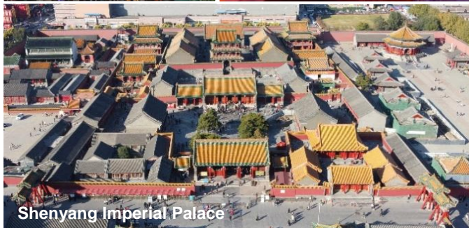
Shenyang Imperial Palace