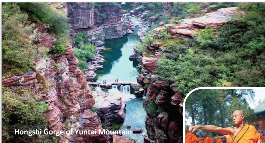
Hongshi Gorge of Yuntai Mountain