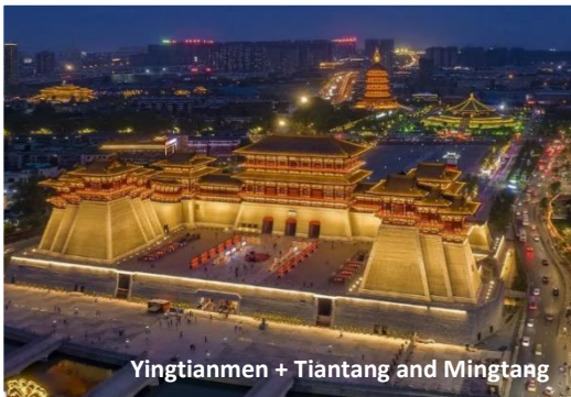
Yingtianmen + Tiantang and Mingtang