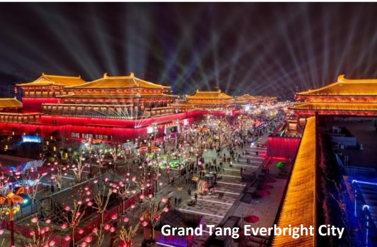
Grand Tang Everbright City