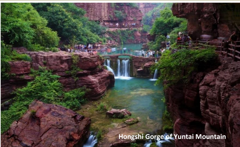
Hongshi Gorge of Yuntai Mountain