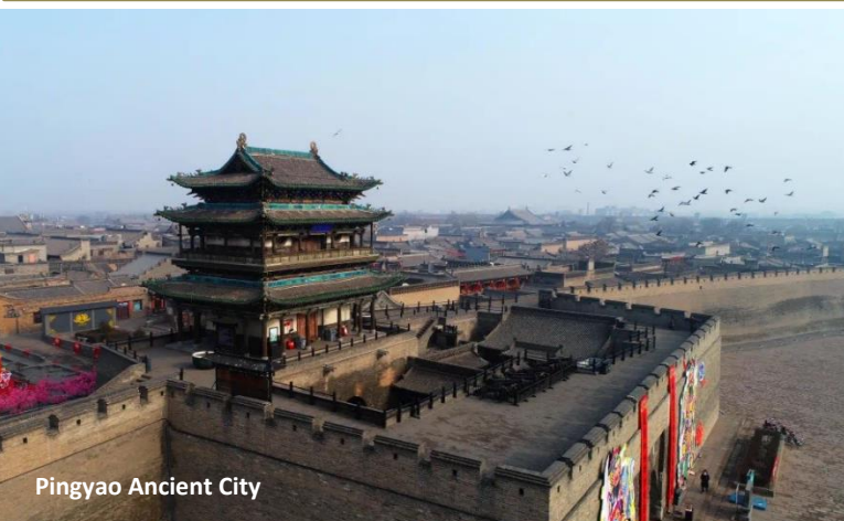
Pingyao Ancient City