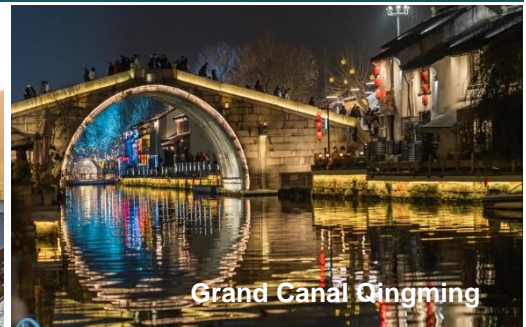
Grand Canal Qingming