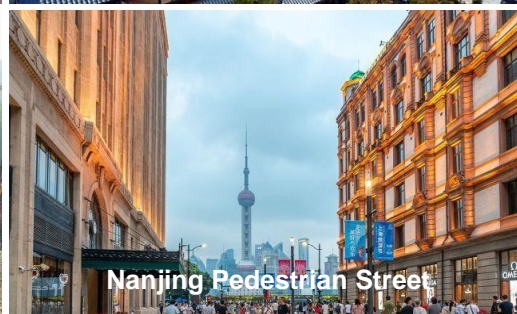
Nanjing Pedestrian Street