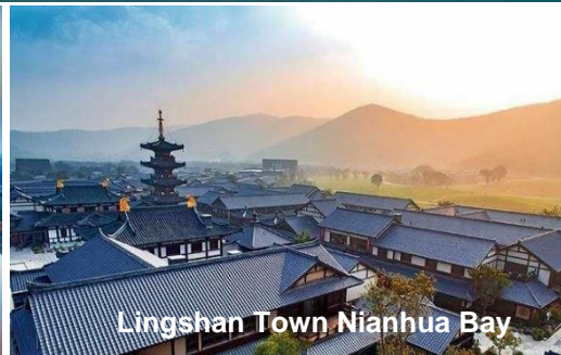
Lingshan Town Nianhua Bay