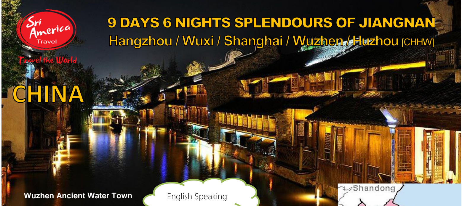
Wuzhen Ancient Water Town