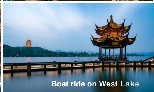
Boat ride on West Lake