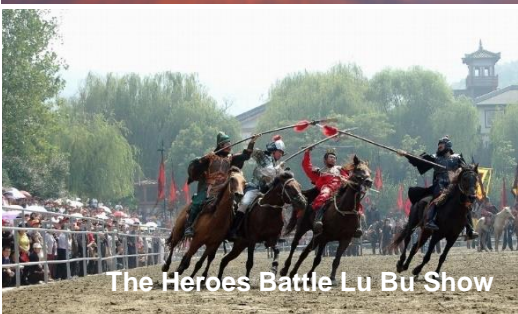
The Heroes Battle Lu Bu Show