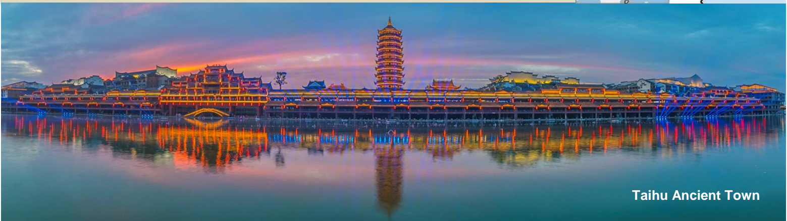
Taihu Ancient Town