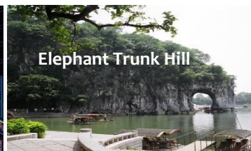
Elephant Trunk Hill