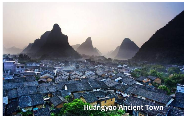
Huangyao Ancient Town