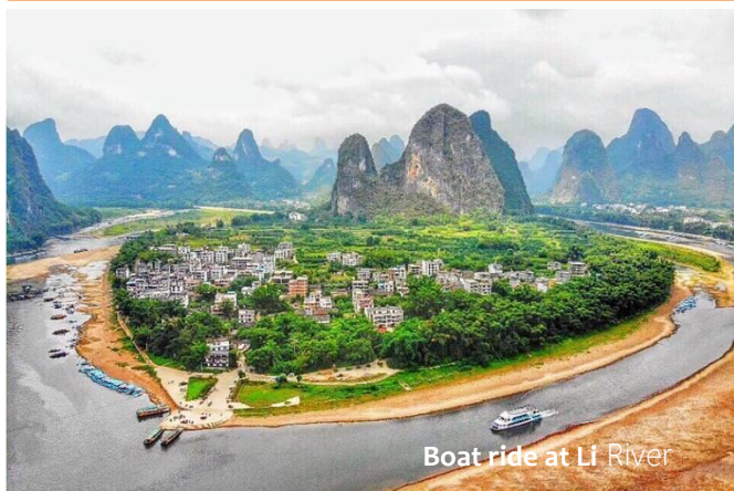
Boat ride at Li River