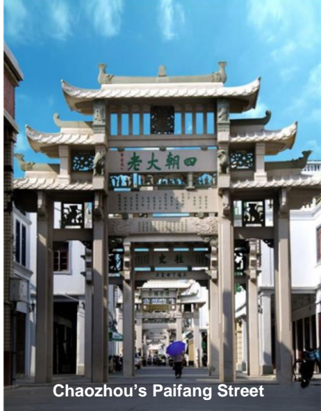
Chaozhou's Paifang Street