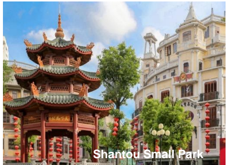
Shantou Small Park