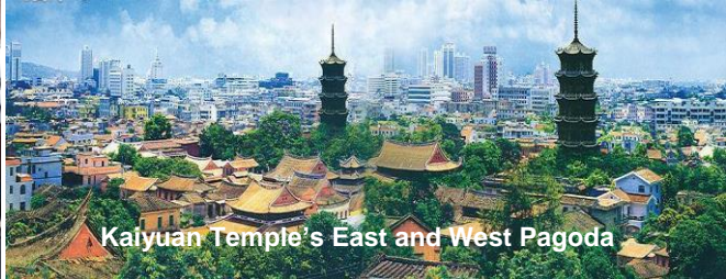
Kalyuan Temple's East and West Pagoda