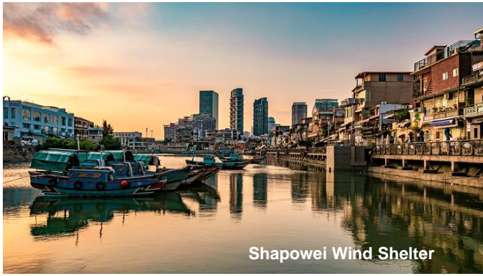
Shapowei Wind Shelter