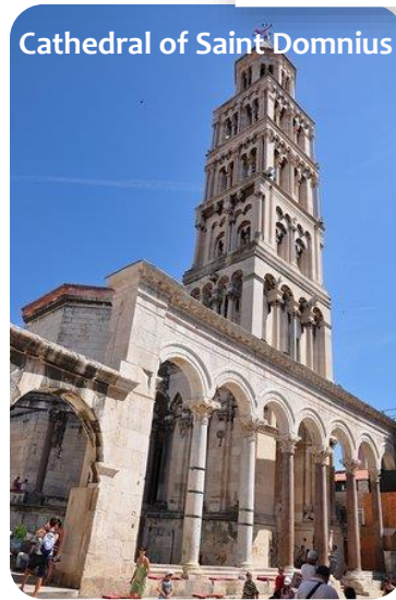
Cathedral of Saint Domnius