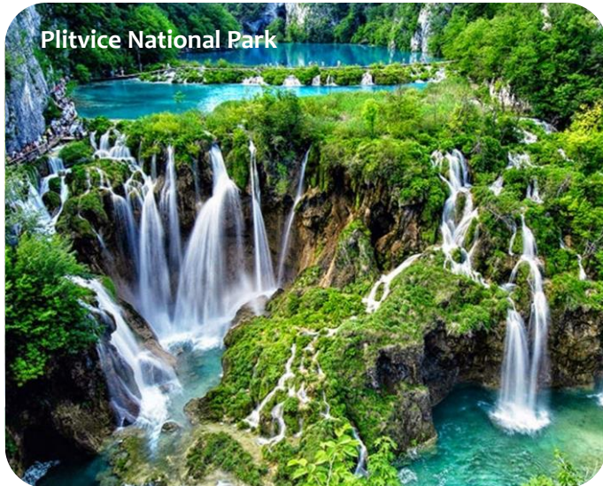
Plitvice National Park