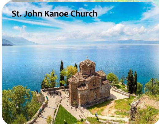
St. John Kanoe Church