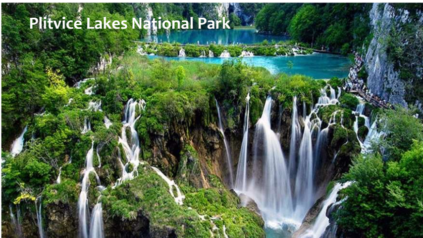
Plitvice Lakes National Park