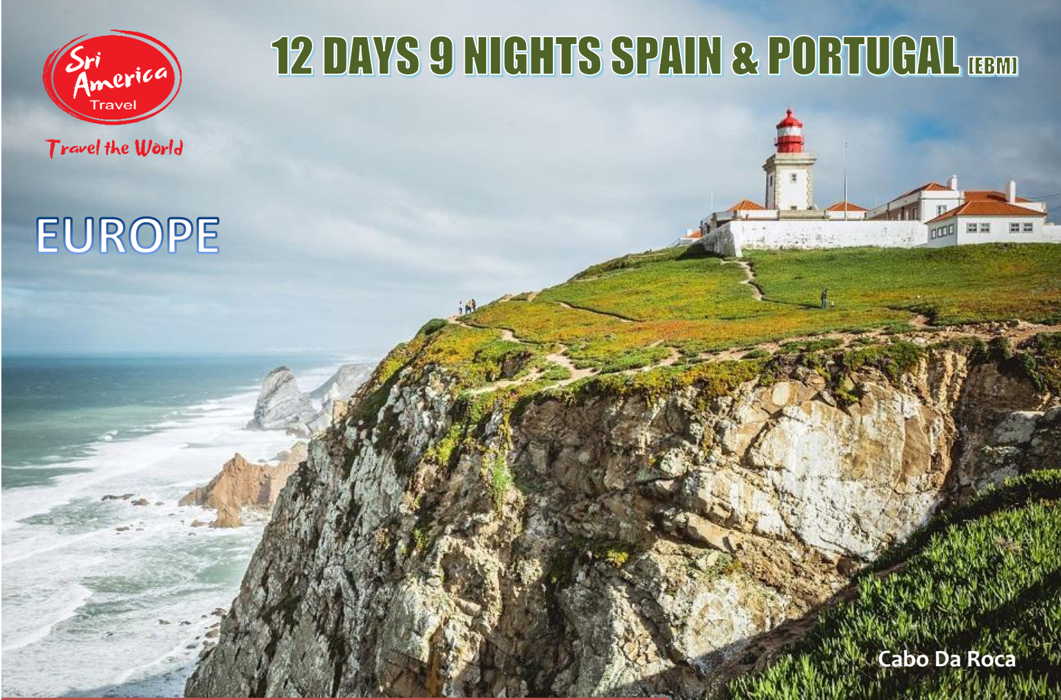
Cabo Da Roca