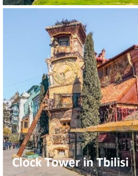
Clock Tower in Tbilisi