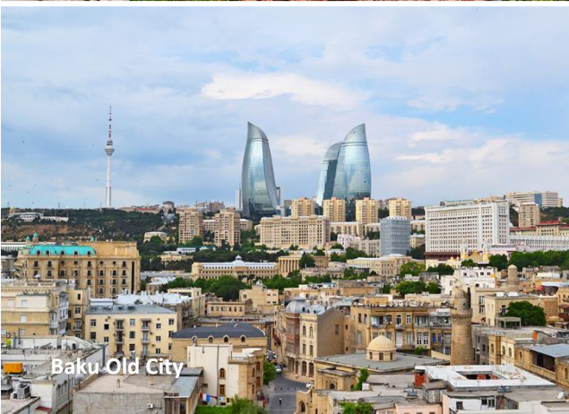
Baku Old City