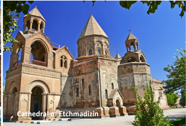
Cathedral of Etchmadzin