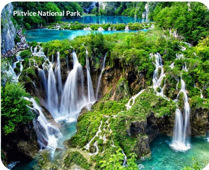
Plitvice National Park