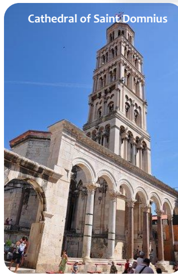
Cathedral of Saint Domnius