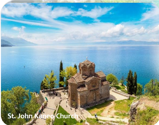
St. John Kaneo Church